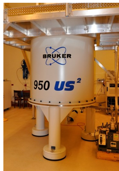
Our 950 MHz NMR spectrometer

Our laboratories are modern, spacious and ideally equipped for technically advanced biochemical and cellular research. Students in the program have access to outstanding centers and research organizations including the Howard Hughes Medical Institute, the University of Maryland Greenebaum Comprehensive Cancer Center, two NMR facilities (950 MHz, two 800 MHz, and three 600 MHz NMR spectrometers), X-ray crystallography facilities, a fluorescence spectroscopy center, the Center for Stem Cell Biology and Regenerative Medicine, and more than 50 nationally and internationally recognized faculty members. Our research is well funded by many agencies including the National Institutes of Health (NIH), The National Science Foundation (NSF), The American Cancer Society (ACS), The Howard Hughes Medical Institute (HHMI), The American Heart Association (AHA), and several other foundations.